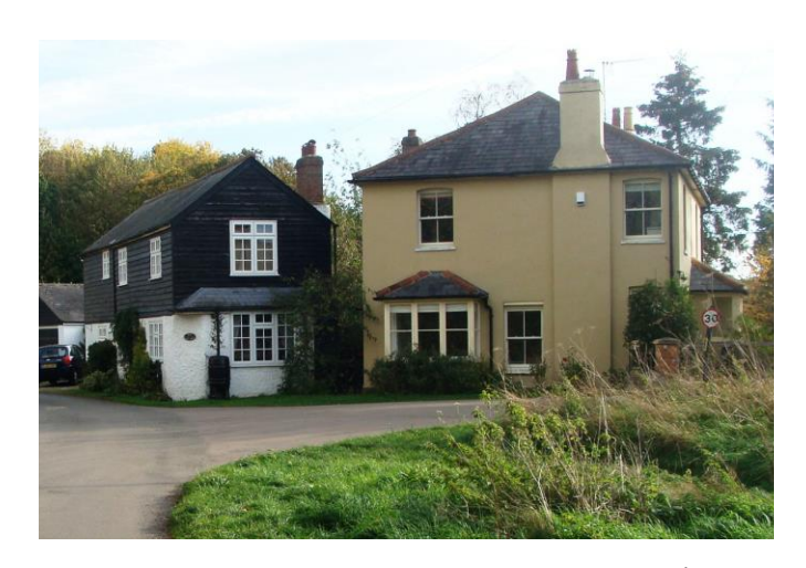
Picture 9: Mill House to right and Mill Cottage; two 19<sup>th</sup> century properties in a strategic location that add to the quality of the conservation area

5.25 Holly Cottage and Penrose Cottage. A pair of mid-20<sup>th</sup> century rendered properties with tiled roof and chimneys. Pyramidal porch detailing to front. Of simple design but worthy of retention. An Article 4 Direction to provide protection for selected features may be appropriate subject to further consideration and notification.