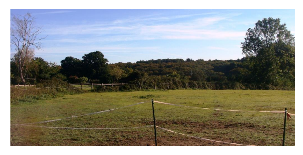
Picture 2118: Part of pasture land to rear and north of The Hunting Box which is considered to be part of the wider landscape and thus inappropriately included in the conservation area, following local practice and Historic England advice