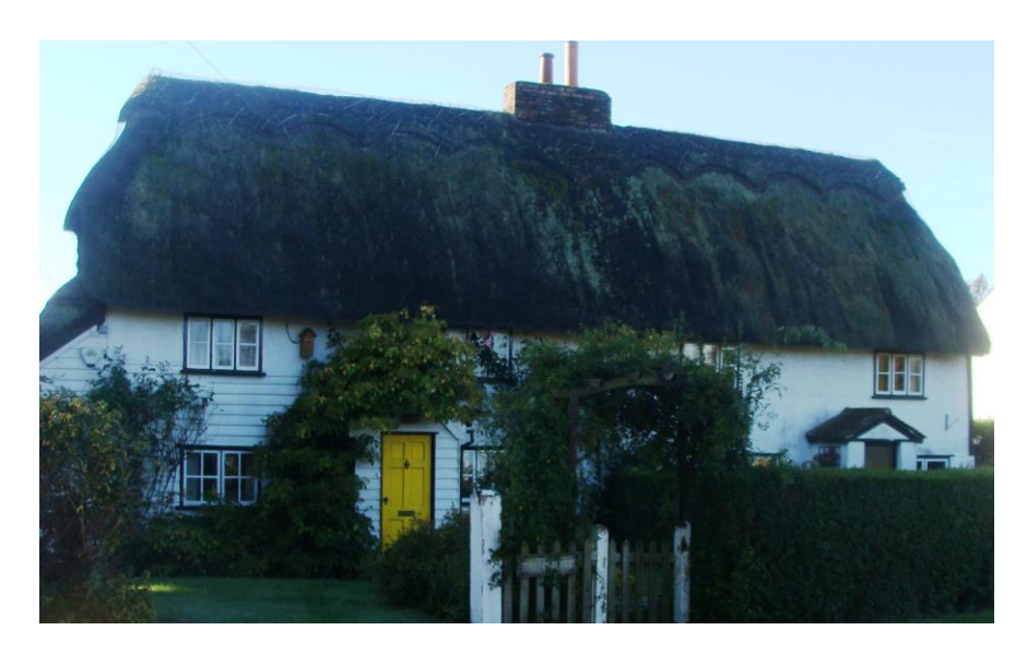
Picture 5: The Cottage and Thatched Cottage – thatched properties predominate amongst those buildings which are listed

5.13 The Cottage and Thatched Cottage - Grade II.18<sup>th</sup> century pair of cottages, timber-framed, plastered and weather boarded with a thatched roof. Two storeys with single storey lean-to extension to the east. Central brick chimney stack.