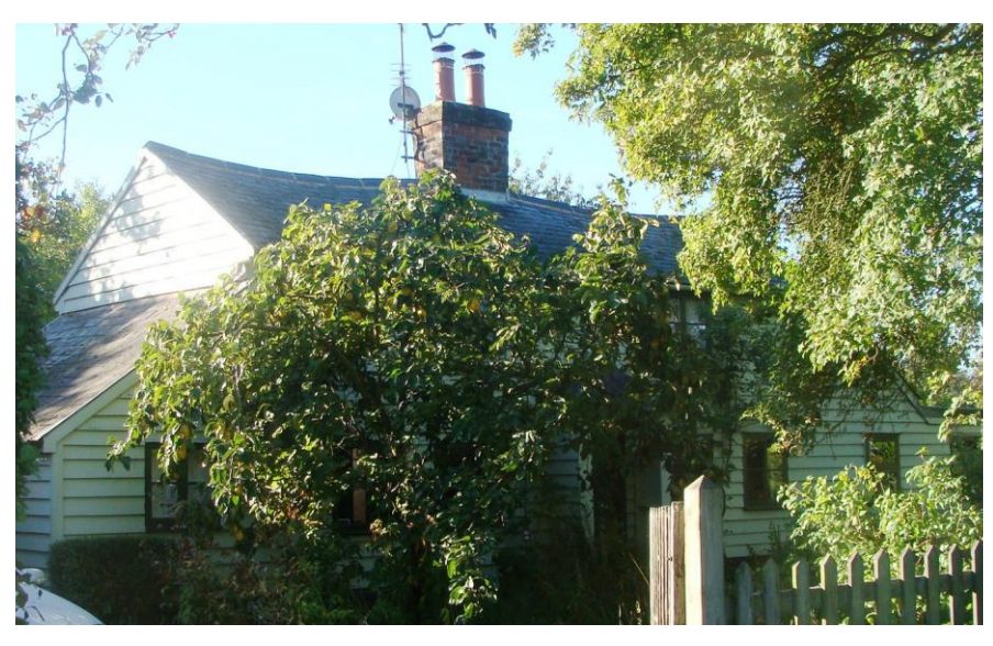
Picture 4: Hitch Lane Cottage. Hidden away and dating from the 19<sup>th</sup> century

5.12 Hitch Lane Cottage – Grade II. 19<sup>th</sup> century cottage, weatherboarded with slate roof. Two storeys with later single storey lean-to extension to the east. Casement windows, central slated porch and brick chimney stack. Modern extension to the west.