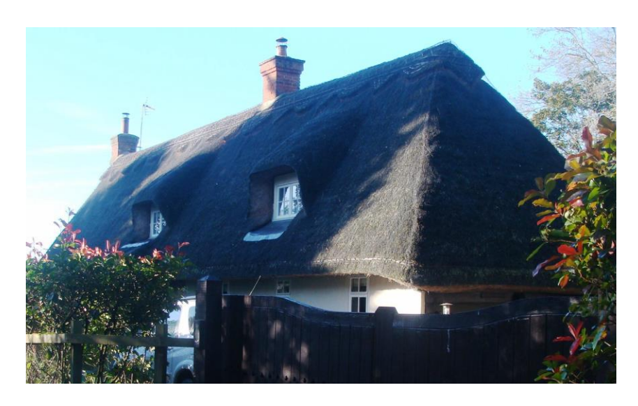
Picture 3: Elm Cottage - now within the <u>proposed</u> extended conservation area

5.12 Hitch Lane Cottage – Grade II. 19<sup>th</sup> century cottage, weatherboarded with slate roof. Two storeys with later single storey lean-to extension to the east. Casement windows, central slated porch and brick chimney stack. Modern extension to the west.