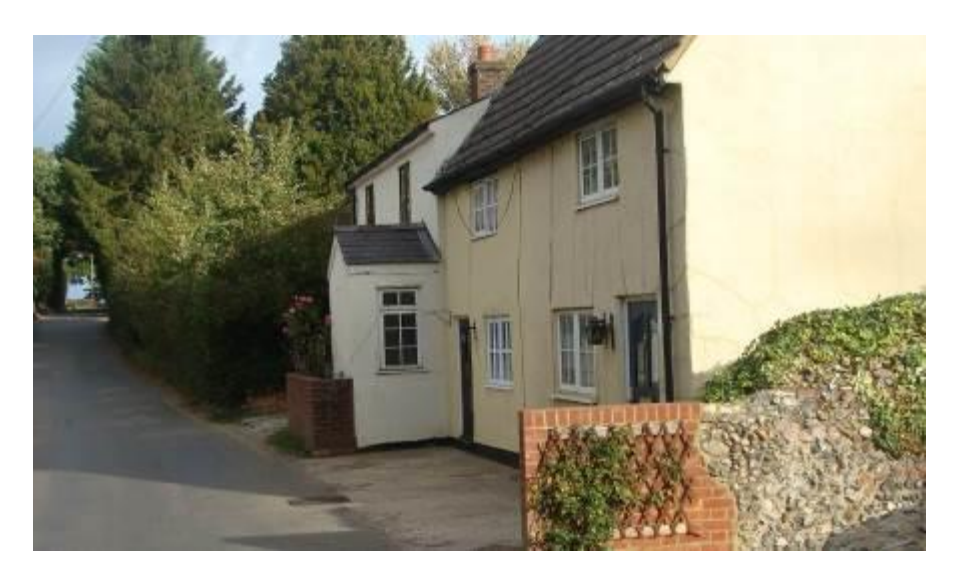
Picture 14: 1-2 Catherine Wheel Cottages and Elderberie Cottage generally make a positive contribution to the <u>proposed</u> extended conservation area

5.31 Nos 1-2 Catherine Wheel Cottages and Elderberie Cottage. This contiguous group dates from the late 19<sup>th</sup> century. Rendered, tiled and slate roofs, prominent central chimney. Porch to front detracts. Other modern details. Nevertheless this group and its massing generally contributes positively to the street scene and on balance an Article 4 Direction to provide protection for selected features may be appropriate subject to further consideration and notification.