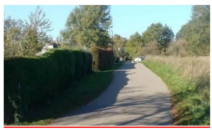
Pictures 18-20: Front boundary fencing details to properties around the Heath vary considerably. Top typical picket type fencing; middle, very formally cut hedging; bottom, a hedging solution which combines various species including