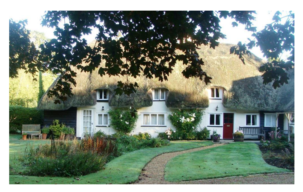
Picture 2: Patmore Cottage dating from the17th century – one of a number of listed buildings in the settlement which are thatched

5.10 Patmore Cottage - Grade II. I7th century, timber framed, plastered and thatched. One storey and attics, single storey outshuts at both east and west extremities of building. Modern casement windows, three dormers, axial chimney stack. Later extension to east of main range.