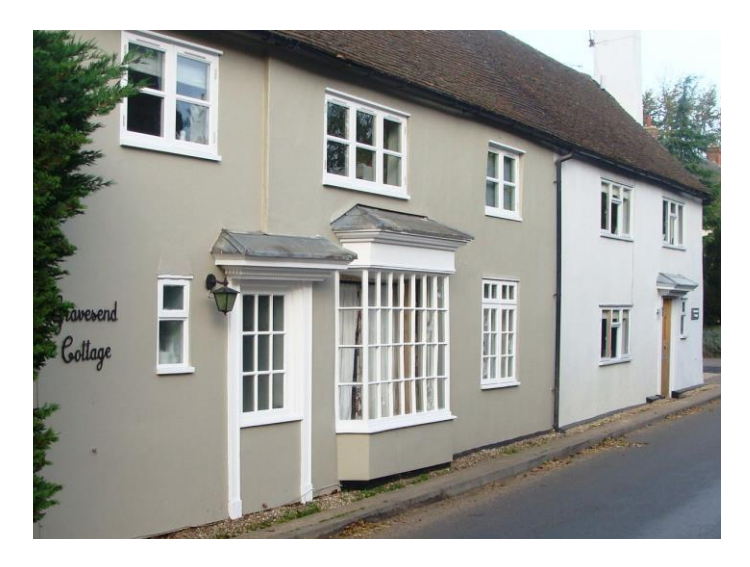
Picture 10: Gravesend Cottage and No.2 Gravesend Cottages make a significant visual contribution in the <u>proposed</u> extended conservation area.

5.27 Gravesend Cottage and No. 2 Gravesend Cottages. Two storey rendered with tiled roof and prominent chimney stacks. Fine window detailing to Gravesend Cottage interpreted as formerly being a shop window. Lead canopy detailing above 'shop' window and entrance doors, probably contemporary with 19<sup>th</sup> century or earlier building. An Article 4 Direction to provide protection for selected features may be appropriate subject to further consideration and notification.