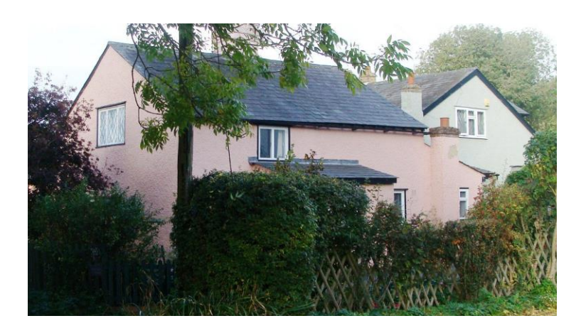
Picture 12: Hillside Cottage and Ashvale Cottage – Despite modern window and later additions this group is considered to be of sufficient architectural and historic quality to be retained and if possible, enhanced

5.30 The Barn. Probably dates from 19<sup>th</sup> century. Assumed to originally have been an agricultural building. Now a single story dwelling with modern detailing. Old tiled roof, probably original elements. Contributes to the variety of historic buildings in the <u>proposed</u> extended conservation area. An Article 4 Direction to provide protection for selected features may be appropriate subject to further consideration and notification.