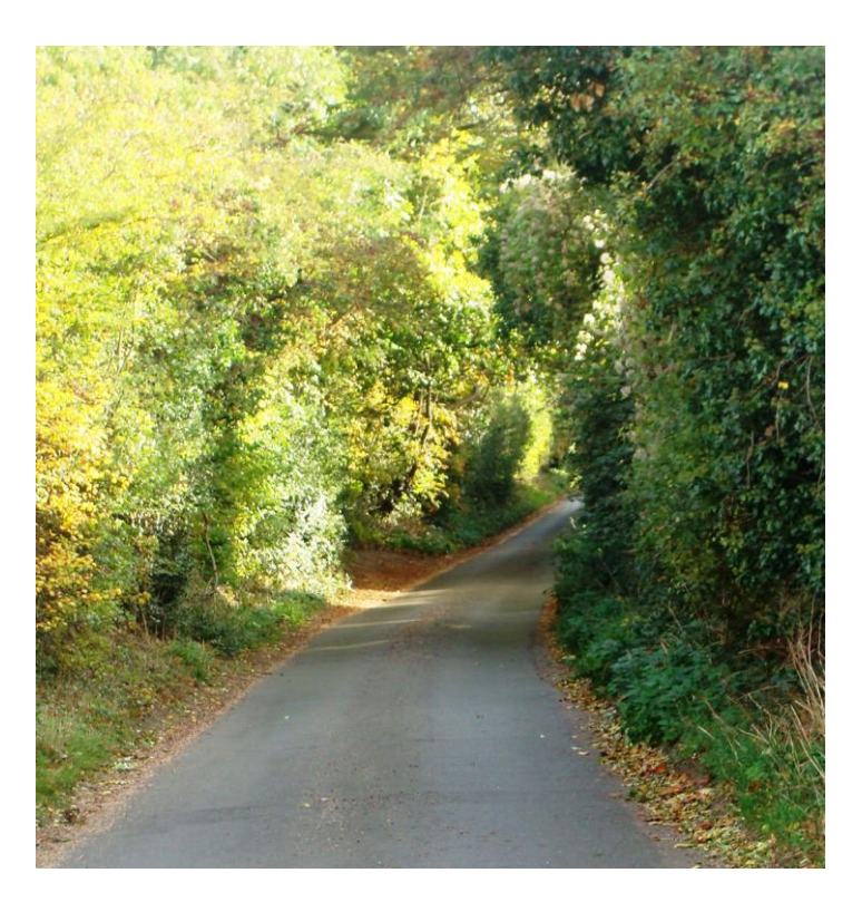
Picture 17: The approach road linking Patmore Heath with Gravesend is an attractive environmental feature worthy of note and retention

5.424 Property boundaries surrounding the Heath: The residential properties surrounding the large triangle of heathland alternatively add to it or detract from it, dependant on their qualities. Some have architectural and historic qualities whilst others are modern. However the essential historic quality of Patmore Heath is that of an extensive triangle of open space surrounded by properties. One consideration relates to front boundaries which vary in respect of materials, character and heights. Such treatments include hedging, walls (some listed), fencing and other means of enclosure. It is considered the visual quality and rural nature of the Heath wcould be enhanced significantly if selected boundary treatments could be were more co-ordinated, by replacing inappropriate boundaries, ideally with a common natural hedging solution. Although the Parish Council did not present a view it is recognized that following the public consultation exercise, there was some opposition to this