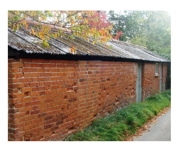
Picture 7: 19<sup>th</sup> century barn north side of footpath 15 which adds historical and architectural interest and diversity in this area. Should further information reveal this building not to be 'curtilage listed' then it should be regarded as a building worthy of retention within the parameters of the legislation.

5.20 Barn/s associated with Gravesend Farm. Probably dating from the 19<sup>th</sup> century/ Render and boarded. Later roof materials. Nevertheless its simple form is not compromised and it contributes to the diversity of the extended conservation area in this location.