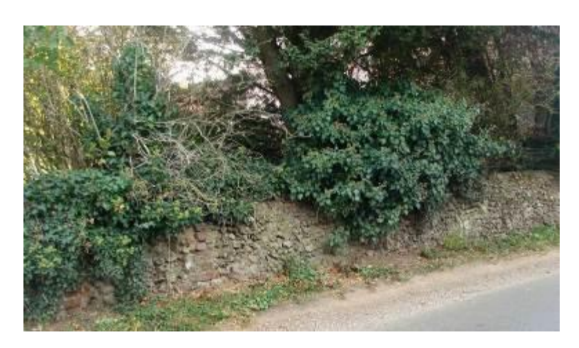
Picture 15: Wall at Gravesend Farm that would benefit from repair work and removal of ivy

5.34 Wall to front of listed building – Gravesend Farm. About 1m in height of flint construction. Would benefit from repairs and removal of ivy.