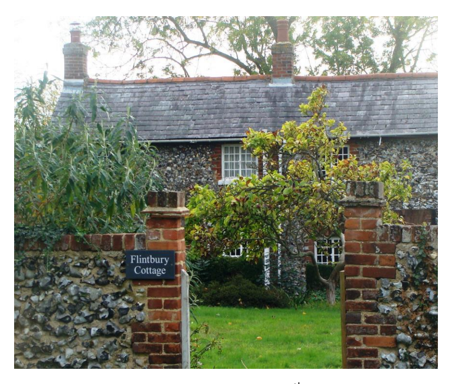
Picture 6: Flintbury Cottage, a charming 19<sup>th</sup> century cottage of flint wall and slate roof construction. Boundary wall also included in listing