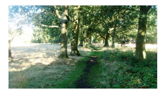
The Heath itself represents an unusual combination of high environmental qualities – visual, traditional and ecological, traditional and visual