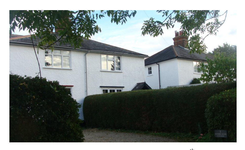
Picture 11: Despite later extension to No.1 these early 20<sup>th</sup> century properties add to the architectural and historic diversity of the <u>proposed extension</u> <u>of the conservation area</u>

5.28 Nos. 1-4 Patmore Heath Cottages, No. 4 named Heathview. Two pairs of 20<sup>th</sup> century semi - detached dwellings which appear on mapping from 1920- 24. Render with hipped slate roofs, each with central chimney. No. 1 extended later to south. On balance an Article 4 Direction to provide protection for selected features may be appropriate subject to further consideration and notification.